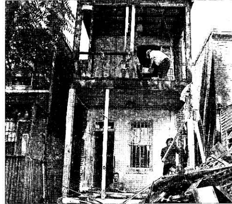
Murillo/Malnati Group is buying abandoned houses, such as 1513 A St. SE, and renovating them to resell.